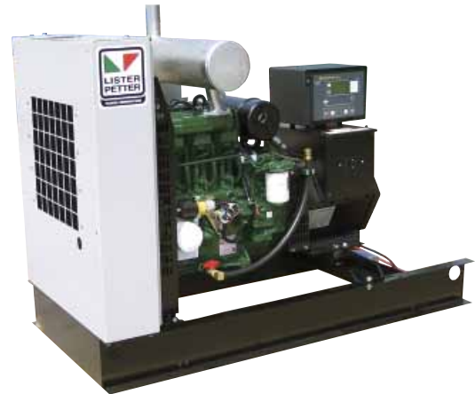
GS Series Open Set shown

The set illustrated is not necessarily the standard build.