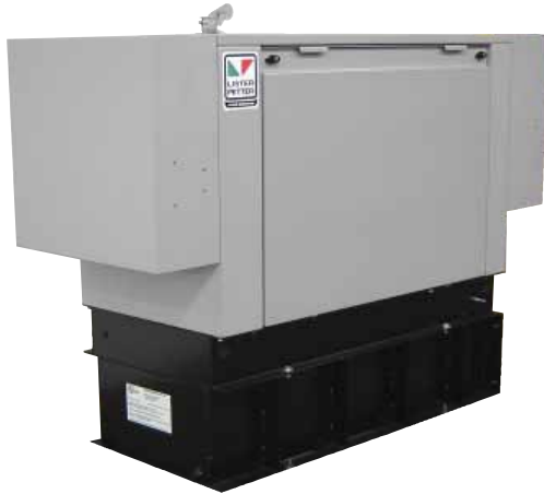
GS Series with optional sound attenuation and sub-base fuel tank shown

The set illustrated is not necessarily the standard build.